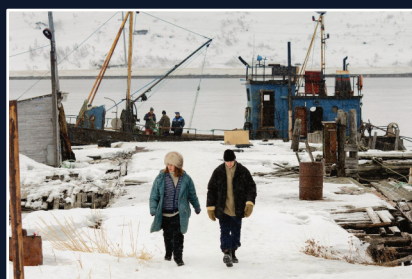
8pm Friday 26 January 2024 COMPARTMENT No 6 (15) 1hr 47mins Finland Subtitled

Bill Nighy is on top form as Alan, a retired tailor searching for his long lost son who disappears after a game of Scrabble. A beguiling and off beat British comedy.