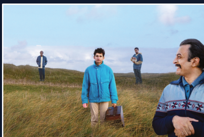
8pm Friday 8 March 2024 LIMBO (12) 1hr 44mins UK

Cait, a shy 9 year old girl who is largely ignored by her dysfunctional family is sent to spend the summer with distant relatives and finds a new way of living. A beautifully realised adaptation of Claire Keegan's short novel, 'Foster.'