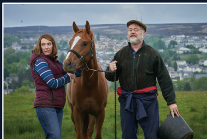
8pm Friday 20 October 2023 DREAM HORSE (PG) 1hr 42mins UK

Set in a Welsh Mining village, the film tells the story of Dream Alliance, an unlikely racehorse owned by a syndicate of villagers. With Toni Collette & Damian Lewis.