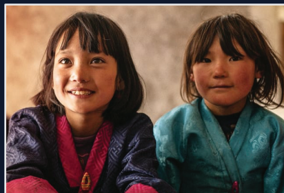
8pm Friday 10 November 2023 LUNANA (PG) 1hr 50mins Bhutan Subtitled

Set in a Welsh Mining village, the film tells the story of Dream Alliance, an unlikely racehorse owned by a syndicate of villagers. With Toni Collette & Damian Lewis.