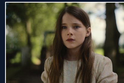
8pm Friday 9 February 2024 THE QUIET GIRL (12) 1hr 31mins Ireland Subtitled

Two wildly different travellers, Laura, a Finnish archaeology student and Ljoha, a drunken Russian miner are forced to share a cramped rail carriage on the 1200 mile journey from Moscow to the Arctic.