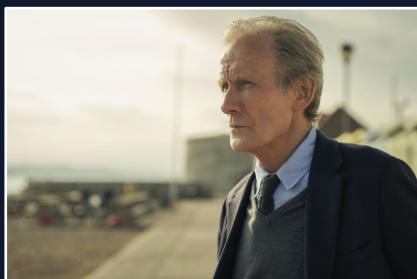
8pm Friday 12 January 2024 SOMETIMES, ALWAYS NEVER (12) 1hr 31 mins UK

A vivid and moving exploration of the turbulent life of the WW1 poet and war hero, Siegfried Sassoon by the feted British director, Terence Davies. Sassoon is buried at Mells.